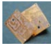
PCB for micro wave